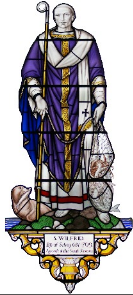
S. WILFRID Bp of Exeter 681-709 Apoc. in the South Saxons

Sunday 8th October 10:30 Parish Eucharist