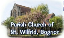
Parish Church of St. Wilfrid, Bognor